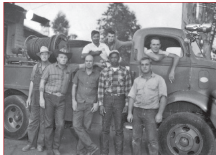
c. 1950—Alpine's First Fire Engine