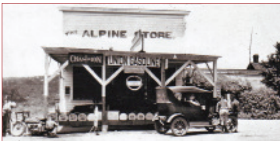
c. 1915—Alpine Store and Gas Station

As we celebrate this birthday, we are also looking ahead to more new programs, exhibits, and activities, and opportunities to tell the story of our amazing little town of Alpine.