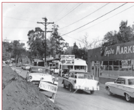
1962—Water Comes to Alpine