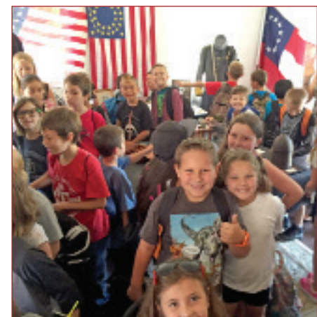
2016—School Tour of Museum