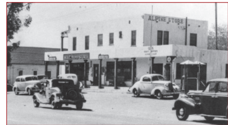
c. 1930—Alpine Store and Post Office