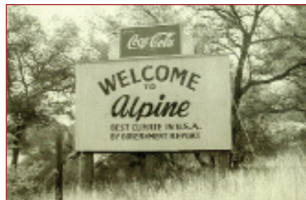
c. 1940—"Best Climate" Welcome Sign